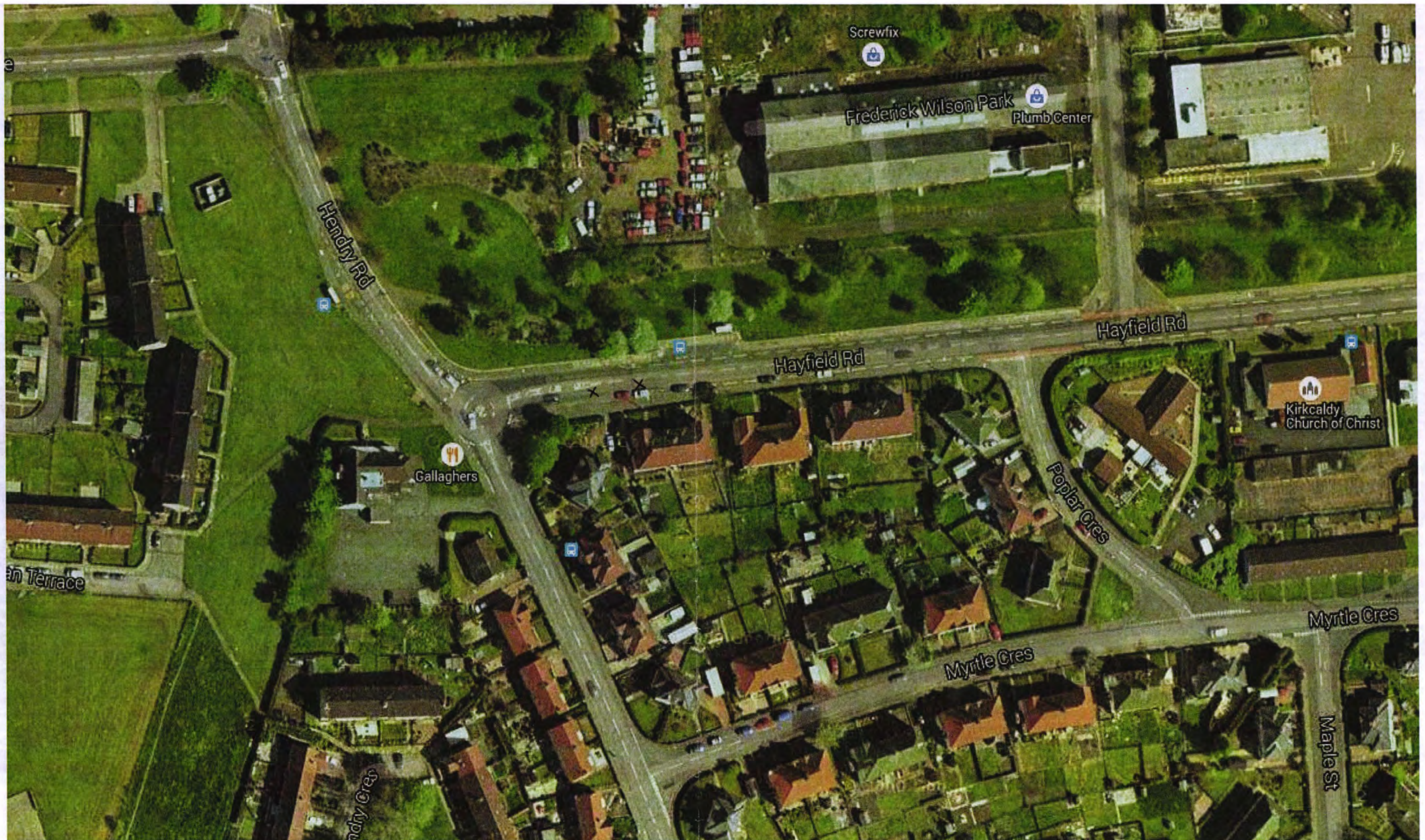
Satellite View of Hayfield Road/Hendry Road, Kirkcaldy